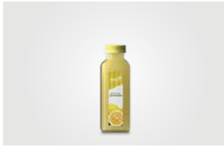
12 oz Square 21.5g | 25g HPP