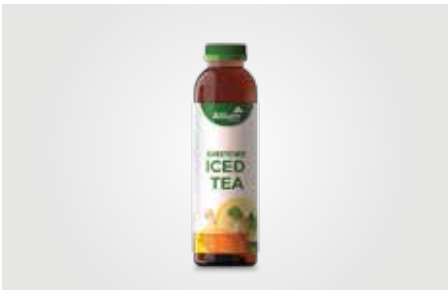
16 oz Round 23g | 32g HPP