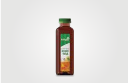
16 oz Square 25g | 32g HPP