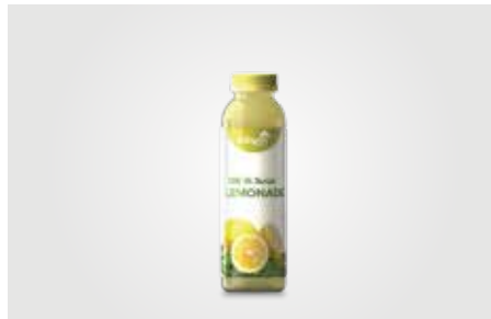
12 oz Round 21.5g | 25g HPP