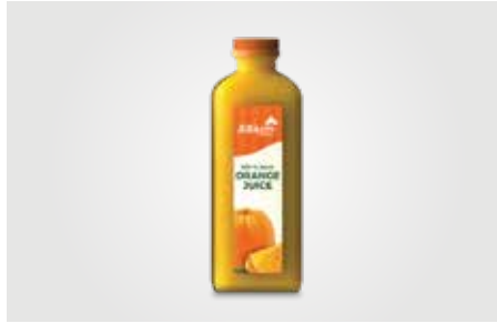
32 oz Square* 51.5g