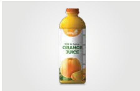
32 oz Round* 32g - Ribbed

*In development—requires minimum order quantity approval