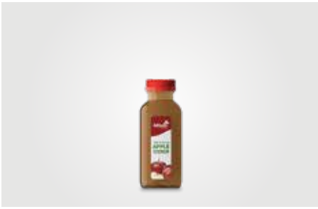
10 oz Square* 18.5g | 32g HPP